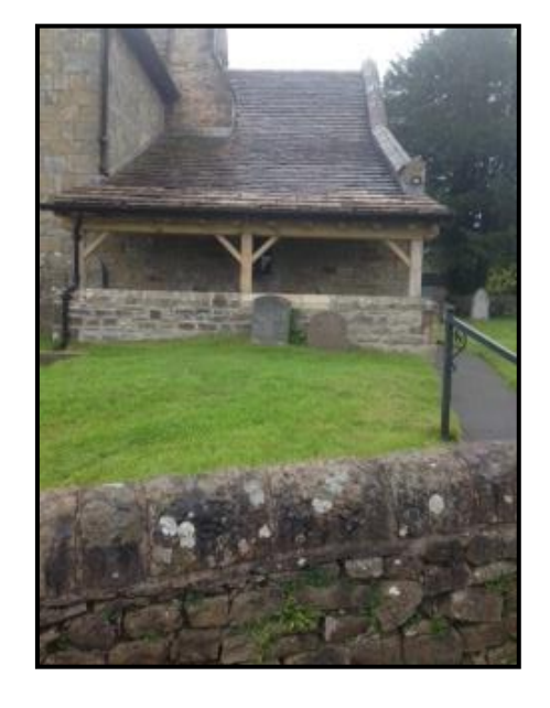
The new roof over the cellar steps

We have extended the church roof over the cellar steps to stop the flooding which has had a disastrous impact several times by damaging the boiler. The use of oak in a beautiful design, with stone roof tiles to match the existing roof has created an excellent addition to the church. We are grateful to the Friends for their generous contribution towards this project.